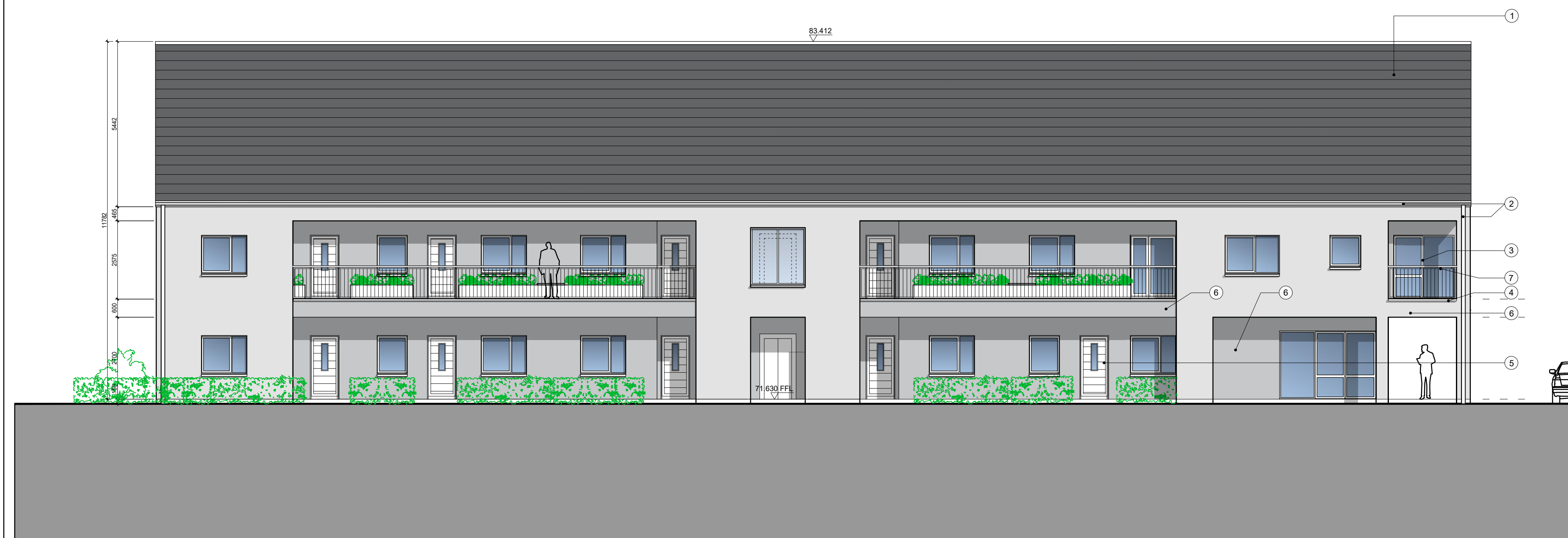
Building A - Proposed North Elevation Scale 1:100 @ A1