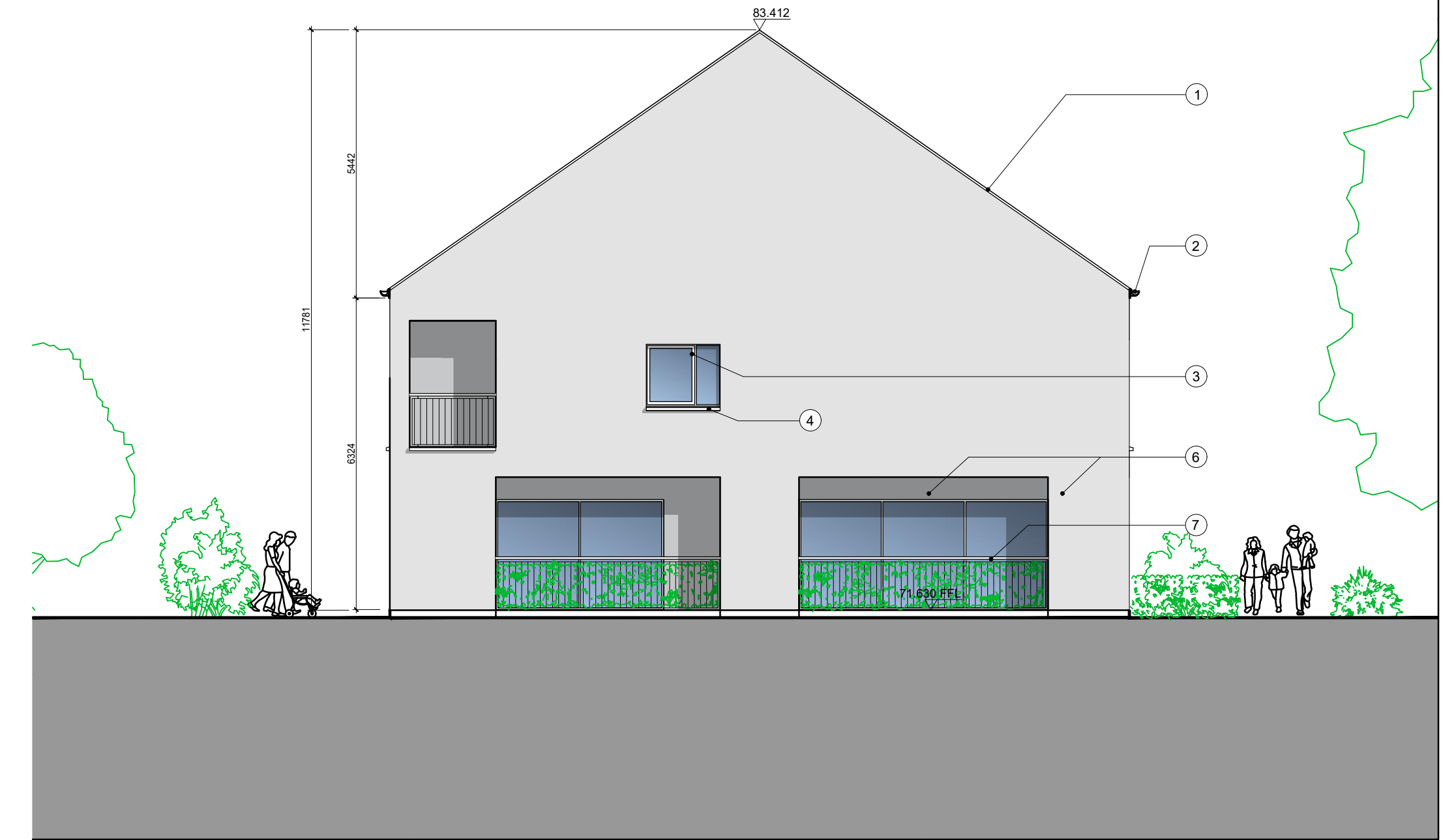
Building A - Proposed West Elevation Scale 1:100 @ A1