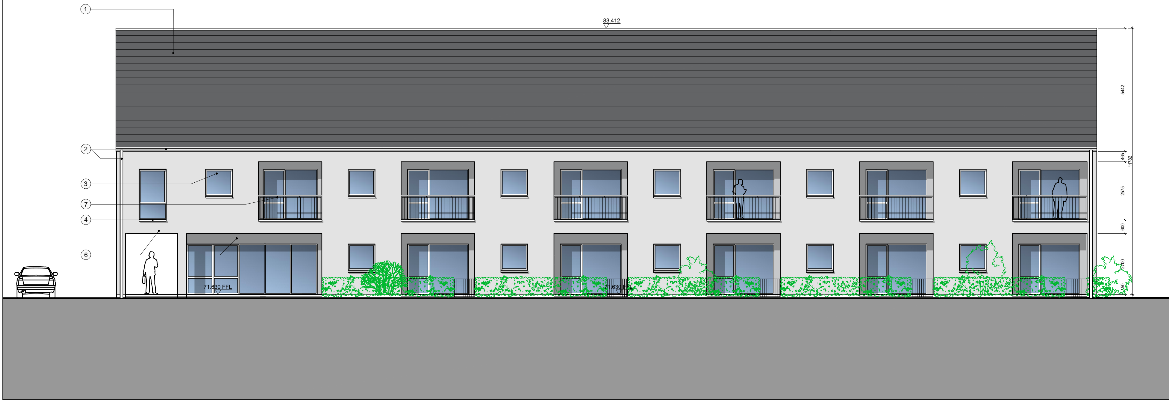
Building A - Proposed South Elevation Scale 1:100 @ A1